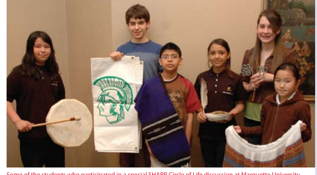
Some of the students who participated in a special SHARP Circle of Life discussion at Marquette University gather together at the end of the day's memorable conversation.

The Circle of Life is a sacred Potawatomi symbol embodying many important Potawatomi values, including the equality of all people. SHARP started the Greater Milwaukee Circle of Life project in 2006 in close collaboration with the Forest County Potawatomi Community Foundation (FCPCF). The Foundation is committed to making children the nation's leaders in ending racism and discrimination. As a key step toward that goal, the FCPCF funded in 2006–2007 an enormous Greater Milwaukee Circle of Life mural — researched and created by hundreds of SHARP elementary students from five different cultures — now hanging permanently in Marquette University's Alumni Memorial Union.